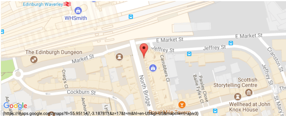
Map data ©2018 Google

(shows/a-boy-named-sue/723380) A Boy Named Sue (shows/a-boy-named-sue/723380) Theatre (search.php?t=4&q=Theatre)